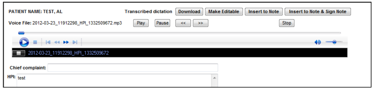
Figure 5: Transcription Queue>Insert to Note &Sign Note

Providers can now insert transcribed content and sign the note directly from the Transcription Queue by selecting Insert to Note & Sign Note :