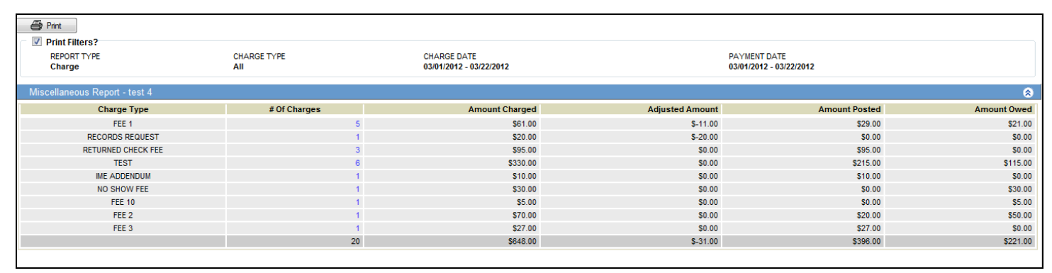
Figure 3: Billing>Reports>Saved Reports>Saved Report Run Once>Miscellaneous Report>View Report

The completed report displays Charge Type, # of Charges , Amount Charged , Adjusted Amount , Amount Posted and Amount Owed for all Miscellaneous Charges: