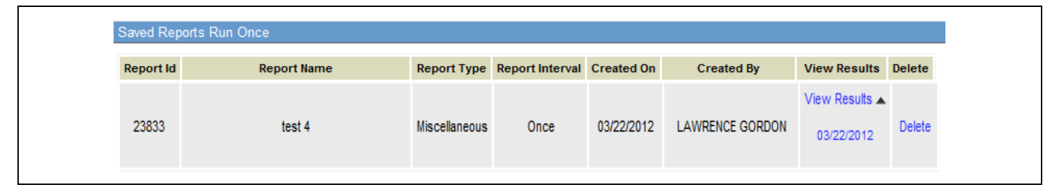
Figure 2: Billing>Reports>Saved Reports>Saved Report Run Once>Miscellaneous Report

The completed report displays Charge Type, # of Charges , Amount Charged , Adjusted Amount , Amount Posted and Amount Owed for all Miscellaneous Charges: