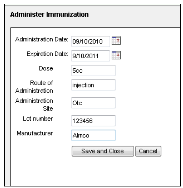
Figure 2: Administer Immunization Screen