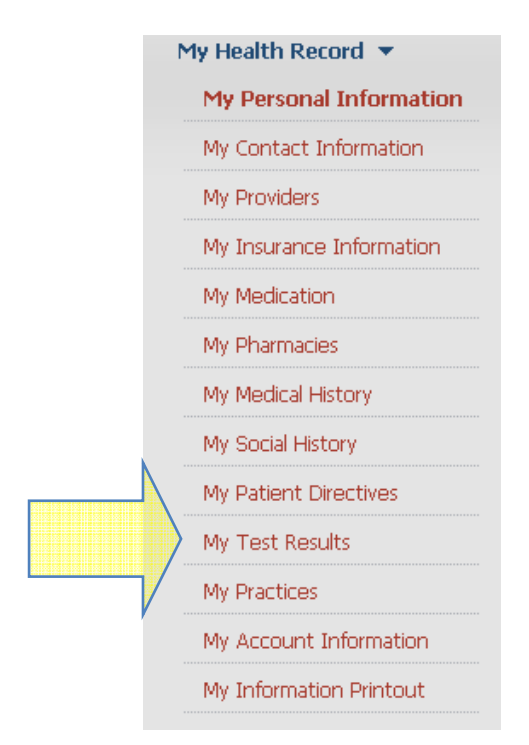
Figure 1: My Health Record Menu on Patient Portal

Patient Test Results have now been added to the Website Portal for viewing by the Patient under their Personal Health Record (note that this is for users of Website 2.0 only):