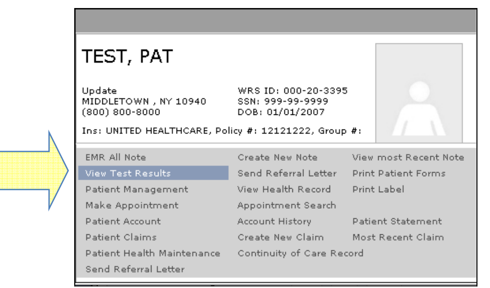
Figure 4: Patient Information Box – View Test Results