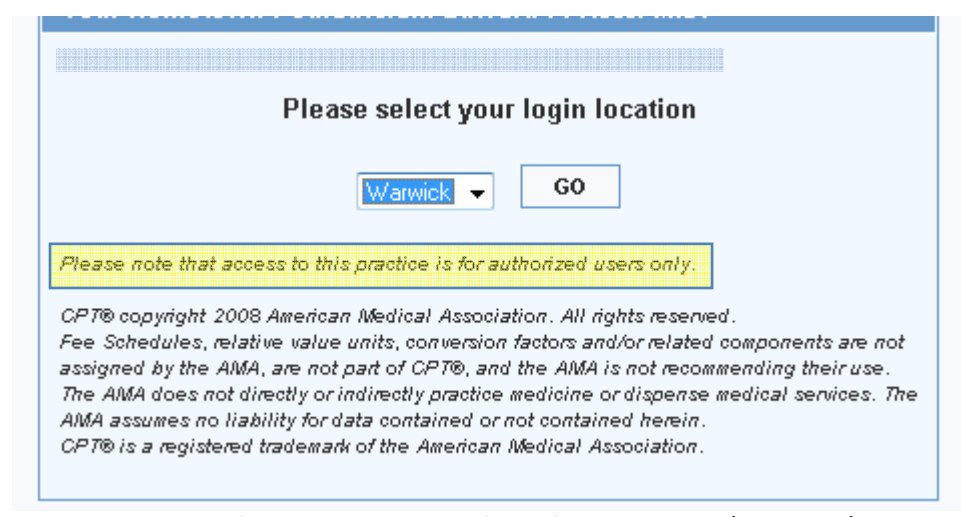
Figure 3: Select Location Screen>Authorized Access Message (User Log-In)